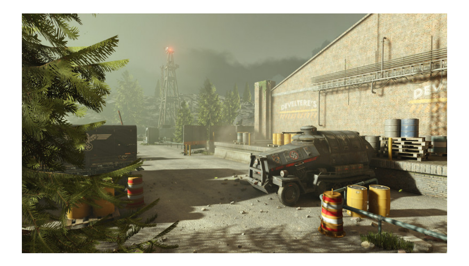
Wolfenstein II: The Freedom Chronicles - Episode 3 Xforce Keygen

Download ->>->> <a href="http://bit.ly/2SIQX7J">http://bit.ly/2SIQX7J</a>